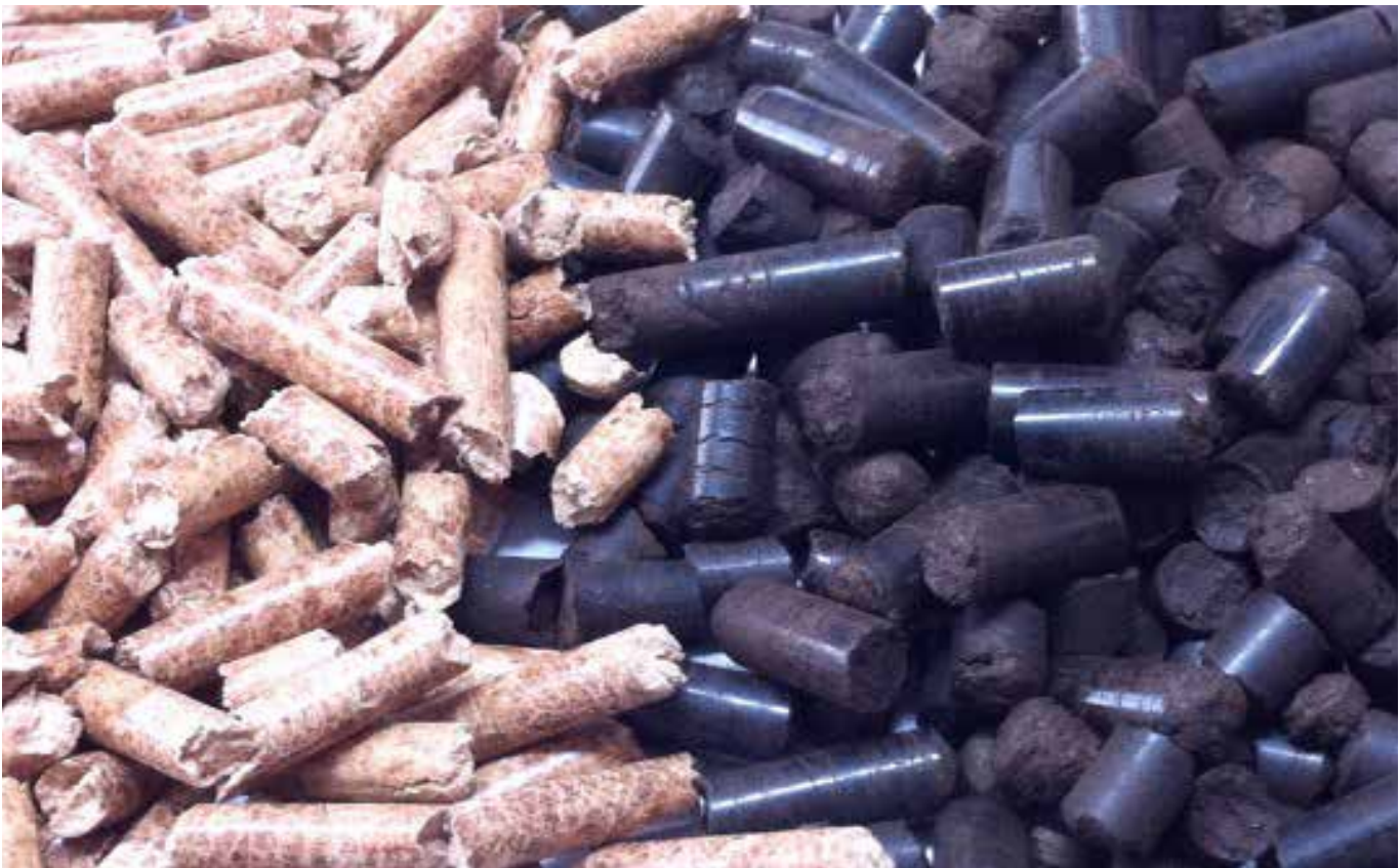
Figure 1: Comparison of normal wood pellets (left) to torrefied wood pellets (right) (BEsustainable, 2007).

Hydrothermal carbonisation (HTC) has recently attracted attention since the product generated has some unique characteristics. The HTC process is using water for impregnation of the raw material in a process vessel heated to 200 to 260°C at an equilibrium pressure of 1.4 to 4.8 MPa for 5-10 minutes.