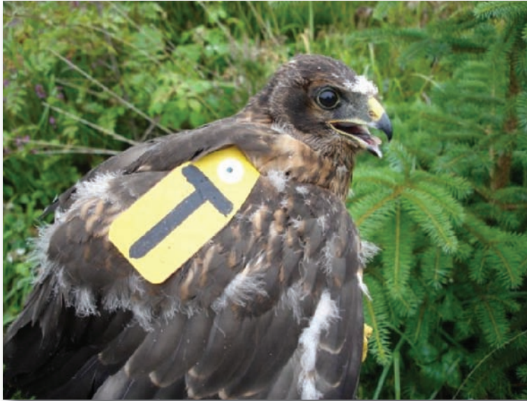
Figure 2: Wing tag on Hen Harrier chick.

breeding pairs and pinpointed their nest sites and followed the fortunes of these pairs and their young throughout the summer. Where possible, nests were visited on three occasions to collect data on clutch size and laying date, brood size and fledging success. Following fledging additional information was recorded for each nest. The timing of breeding at each of the study locations differed slightly. The earliest observed hatch date occurred at a Hen Harrier nest in the Ballyhouras during the second week of May 2007, while hatching was completed in that area by the end of June. By contrast, the first chick did not hatch in the Clare study area until the first week of June, while hatching there was not completed until mid-July 2007. Timing of breeding in the Slieve Aughtys and Kerry study areas occurred between these two extremes.